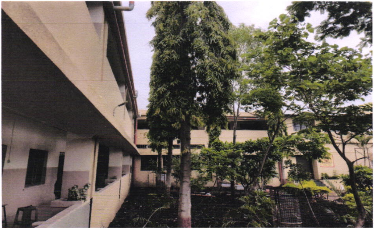
Rain Water Harvesting at Main Building