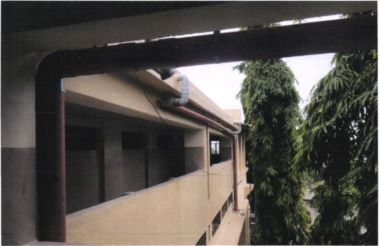
Rain Water Harvesting at Main Building