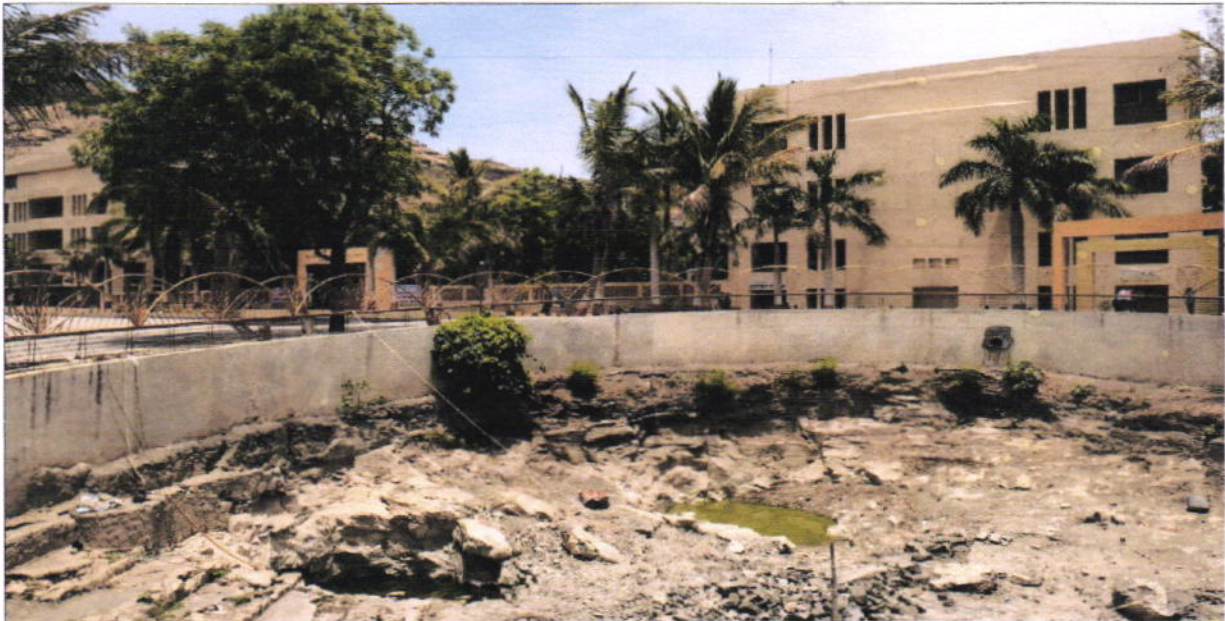
Open Well Before Rain for Rain Water Harvesting and Recharging