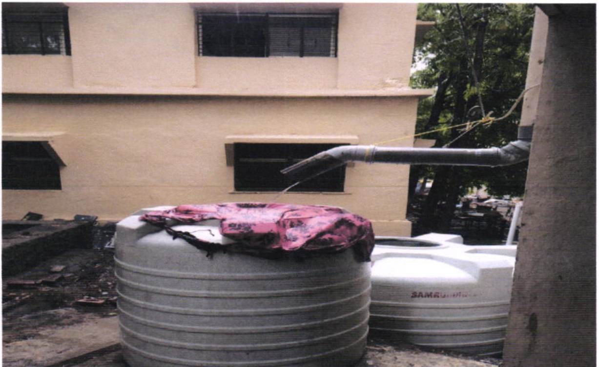
Water Collection as Distilled Water at Chemistry Department