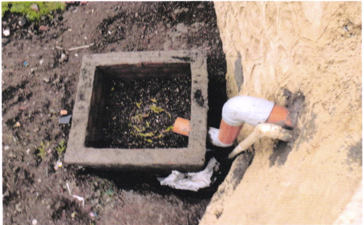
Roof Top Rain Water Collection Chamber