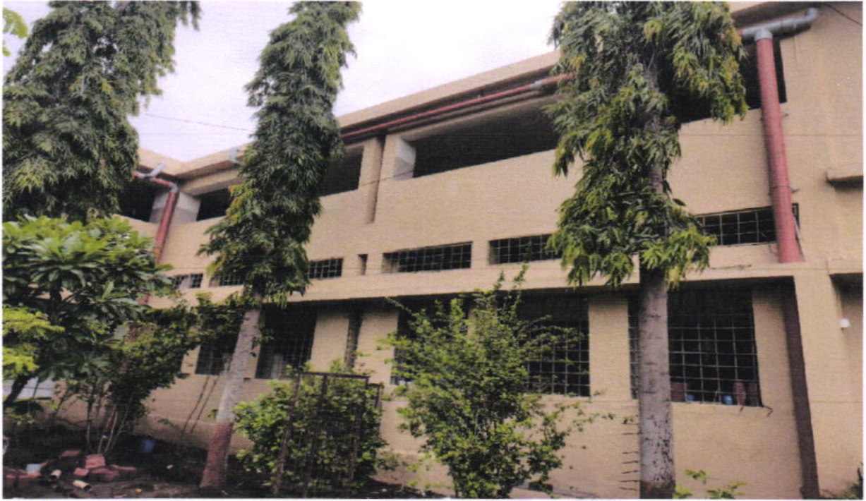
Rain Water Harvesting at Main Building