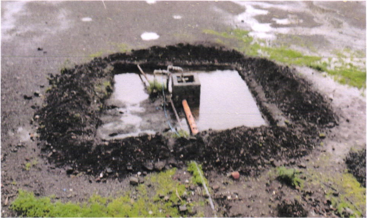
Bore Well Recharge