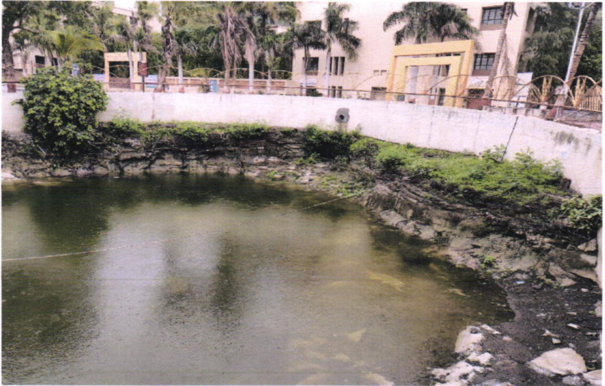
Open Well After Rain for Rain Water Harvesting and Recharging