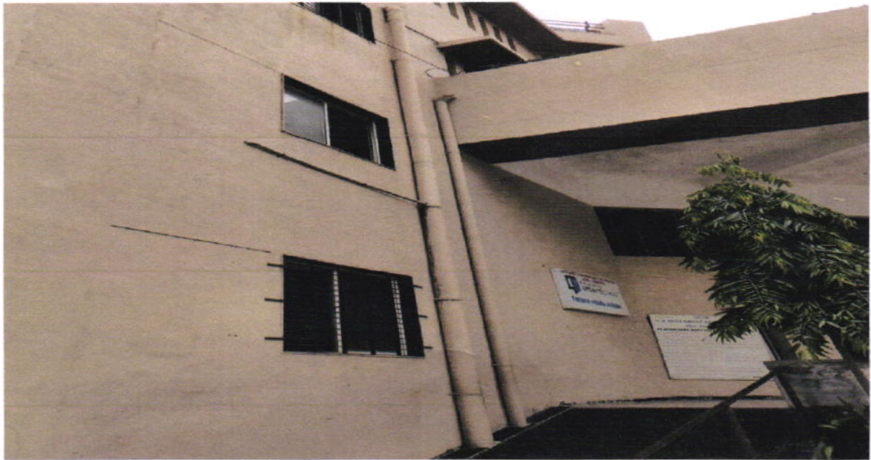
Rain Water Harvesting at New Building