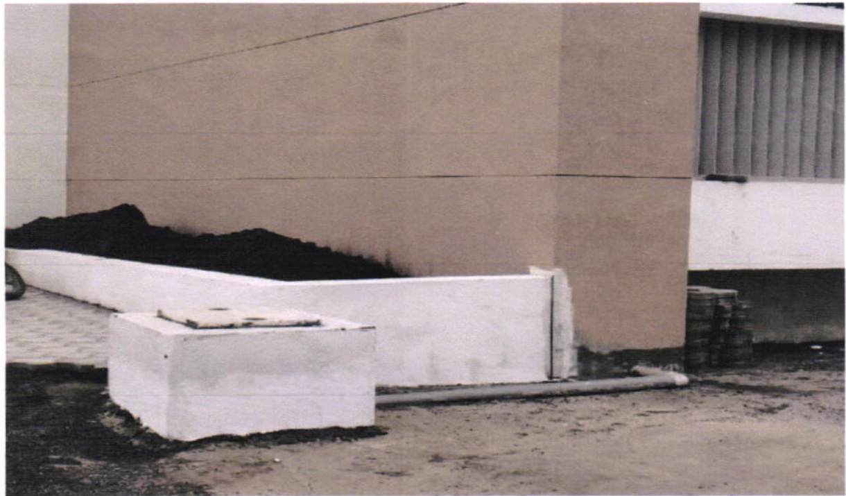
Rain Water Harvesting at Science Building